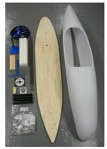
"Just like a big Meccano set" The soapbox derby kitset.

to sign up, and now we take over the workshop at lunchtime as they assembled the big kit. They